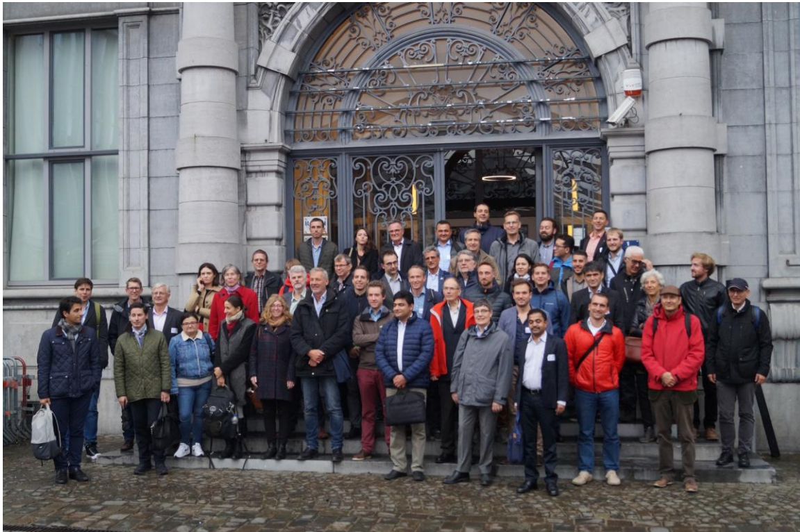
The ERA-Net SES Family of Projects in Namur

Thank you very much for making the JPP Smart Energy Systems Conference 2019 such a success! It has been a pleasure to welcome 29 projects from 4 ERA-Net SES calls to the ERA-Net SES Family of Projects Meeting at La Bourse in Namur, Belgium from October 7 to 9.